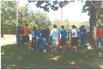
Area school students participating in the BEST Robotics Competition held on September 18, 2010 on the grounds of the Kays Foundation.