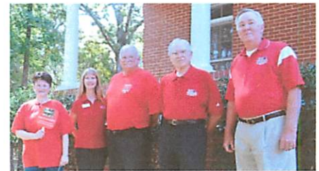
Tours of the "Pleasance" walkway were given to guest by the Arkansas Forestry Department.

On Saturday, September 18, 2010 the Kays Foundation hosted a celebration from 2:30 p.m. to 4:00 p.m. to commemorate a century of funding and service to Arkansas State University.