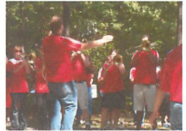
ASU "Sound of the Natural State Band"