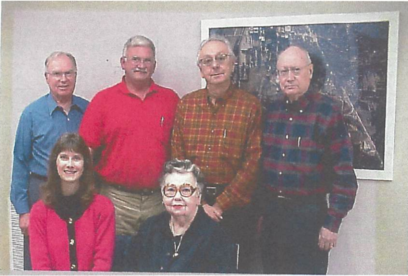
In 2002, the Arkansas State College Foundation Board of Trustees pose for a photo in the break room of the shop building at 2506 Banks.