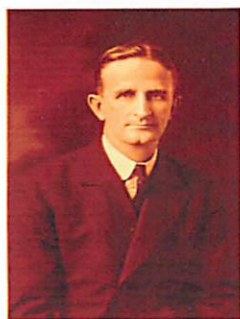
Arkansas State University's

The Kays Foundation is incorporated as a nonprofit corporation and is governed by the provisions of the Arkansas Nonprofit Corporations Act of 1993. It also holds Federal Internal Revenue Service status as a 501(c)(3) organization.